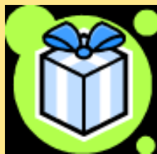
Customer reward scheme