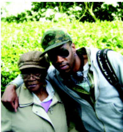
A sheltered housing resident