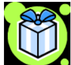
The reward scheme logo

The winner of the latest draw was a Walthamstow resident who enjoyed his prize of a break at Pontins holiday camp.